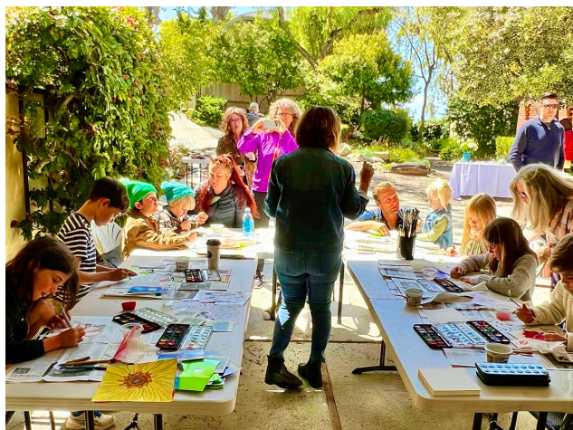
Children's art workshop

A big thank you to our amazing volunteers—from donating plants to running garden tours to holding art workshops and more. We also always appreciate the SoCalPapa Artists who came to paint in the garden. It was nice to enjoy a community event on such a perfect spring day!