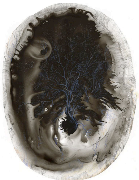
Yevgeniya Mikhailik's "Walnut" is among the artworks on display